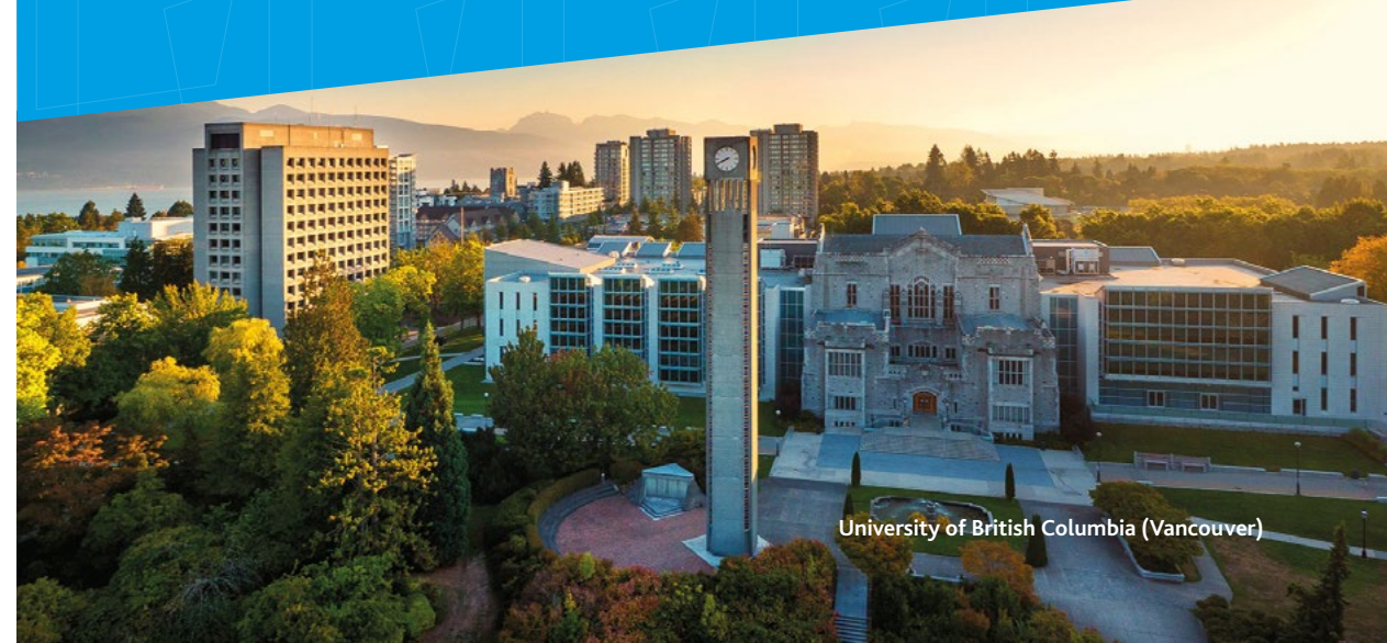
University of British Columbia (Vancouver)